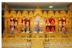
The main shrine